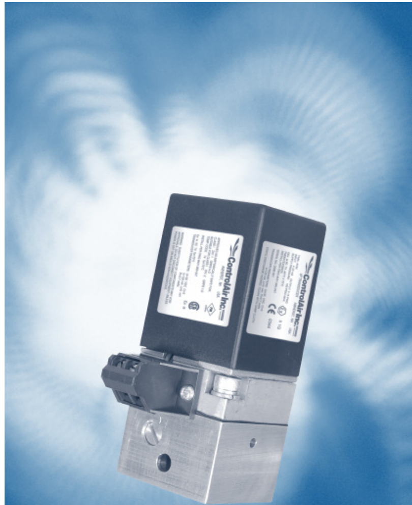
Shown actual size

Ui (Vmax) = 30 VDC Ii (Imax) = 125 mA Ci = 0 Li = 0 Pi = 0.7 watts max.